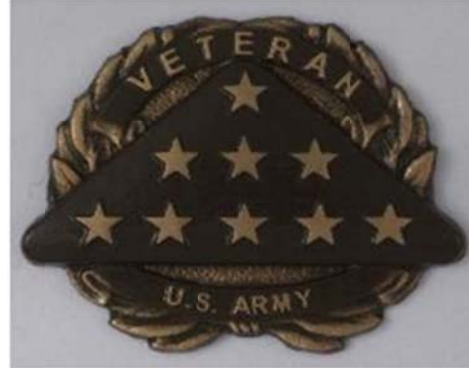
3" & 5" Medallion

The VA is developing a new form to apply for the medallion. Until that is completed the VA has instructions at www.cem.va.gov/hm_hm.asp . "Until a new form specifically for ordering the medallion is available, use VA Form 40-1330 ; Application for Standard